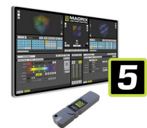
Madrix License Key 5