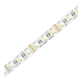
High Quality RGBW LED Strip AcuHue™ (5500K) CV