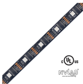
Direct DMX RGB UL LED Strip Pixel-by-Pixel Control 2.0