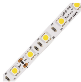
High Quality White LED Strip AcuVivid™ (4000K) CV