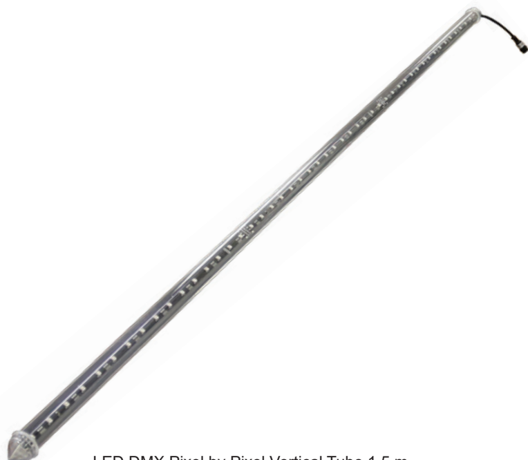
LED DMX Pixel by Pixel Vertical Tube 1.5 m DMX-TUBE-3232™