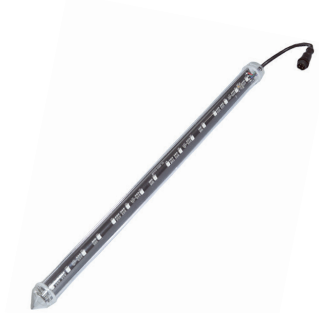
LED DMX Bi-Pixel Vertical Tube 0.5m DMX-TUBE-1608™