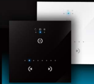
STICK-GU2 Glass Touch Sensitive Control Keypad