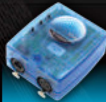
SLESA-IP1 IP Version

The complete range of stand alone DMX interfaces.