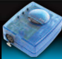
SLESA-U9 Entry level USB