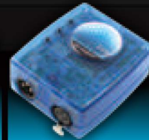
SLESA-U8 USB Version