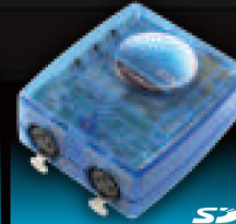
SLESA-UE7 USB-Ethernet Version